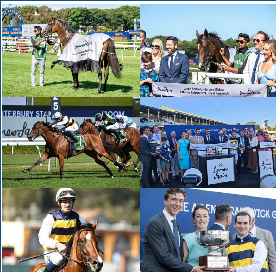
LADY LAGUNA 1300m GROUP 1 CANTERBURY STAKES , Randwick Trained by Annabel Neasham