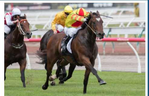
Pictured: Lankan Rupee wins 2015 G1 Lightning Stakes

NAME THE RACEHORSE - LANKAN RUPEE, multiple G1 winner and famous for his heart shaped head marking