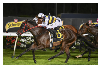
Principessa 1900m BM78, Canterbury Park Trained by Joe Pride