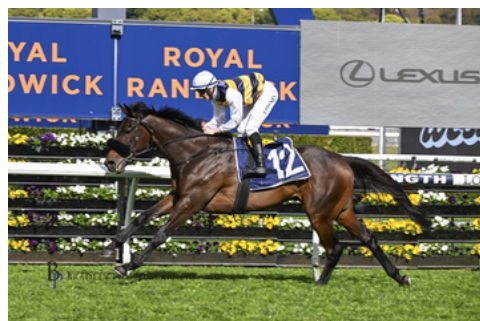
Athabasca wins Listed CTC Cup