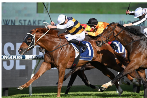
Cepheus wins $1.5m Alan Brown Stakes