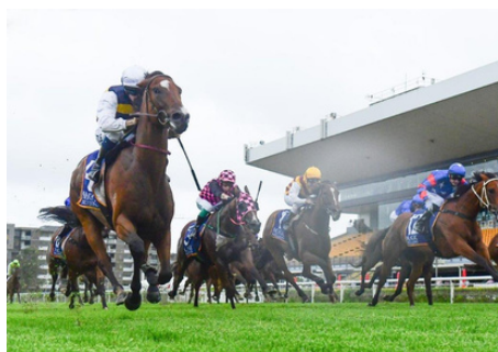
Lady Laguna' wins Listed Nudge Stakes

We've compiled a spreadsheet of all feature races and our potential runners, with a link HERE .