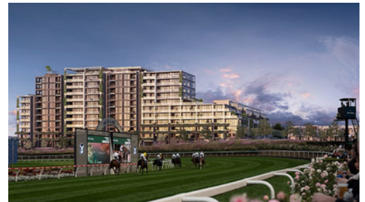
Pictured: New finish line and development