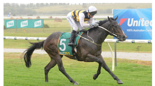
Pictured: Recent winner Altruist - bred at Arrowfield Stud