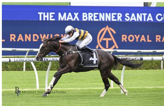
BABY RIDER 2000m Listed ATC Cup , Randwick Trained by Bjorn Baker