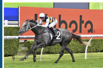
CLOUDLAND 1400m CG&E BM72, Randwick Kensington Trained by Kris Lees