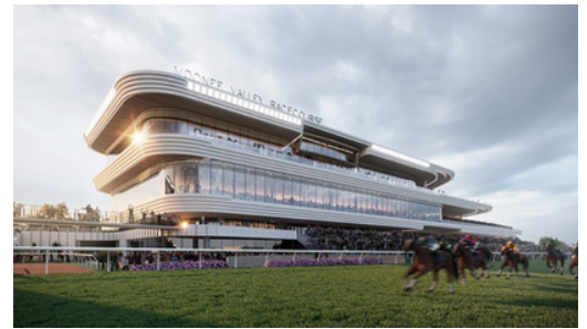
Pictured: Moonee Valley's new Grand Stand