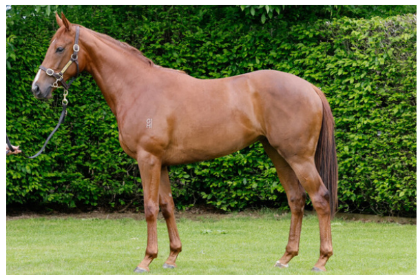
Pictured: El Roca x Singa Songa '21 filly

To have more of a staff training academy, to focus on proper horse skills before entering the racing industry.