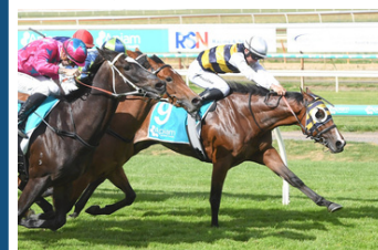
RUMINATE 1400m BM58, Bendigo Trained by Matt Cumani