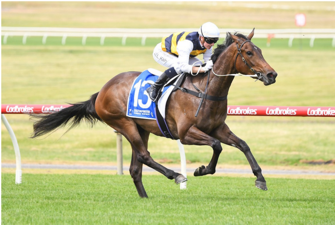
Pictured: Fretta wins at Sandown in December 2022