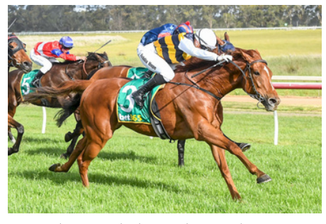
Pictured: Win O'Clock wins the Hamilton Cup

NAME THE STALLION - Australia, sire of our Hamilton Cup winner Win O'Clock