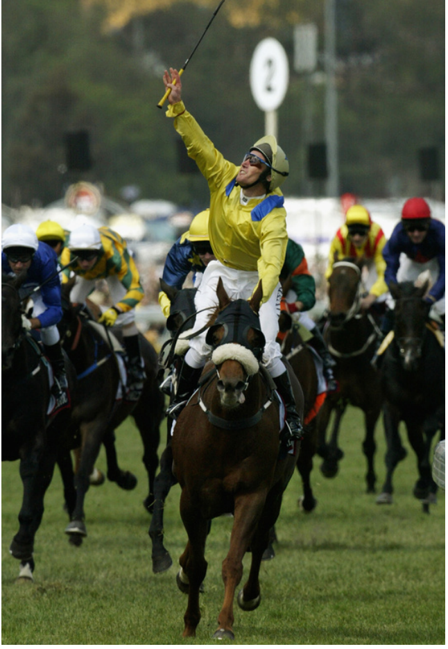
Damien Oliver wins the Cup on Media Puzzle in 2002