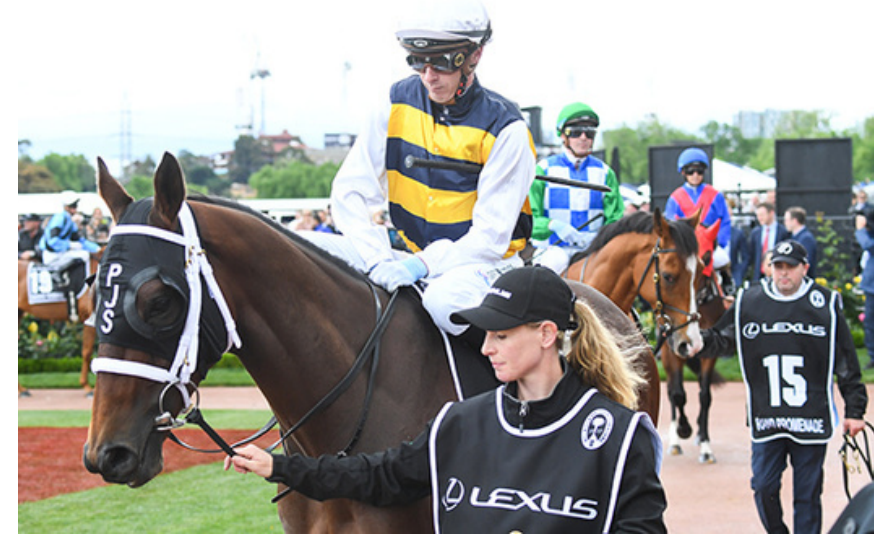
Pictured: Dagiansweet Junior in the 2022 Melbourne Cup