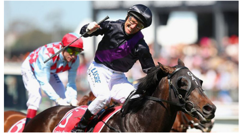
Damien Oliver celebrating the Melbourne Cup win on Fiorente in 2013