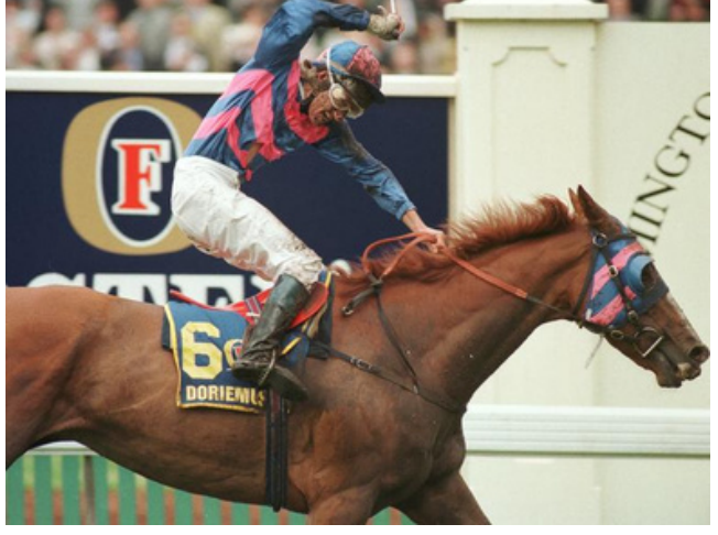
Damien Oliver wins the Melbourne Cup on Doriemus in 1995