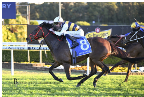
PRINCIPESSA 1550m BM72, Canterbury Park Trained by Joe Pride