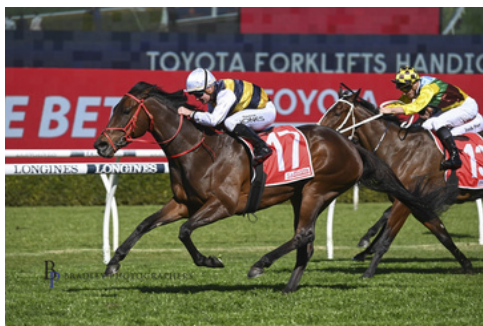
PRINCIPESSA 1600m BM78, Randwick Trained by Joe Pride