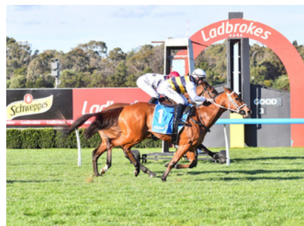
MARCHONS ENSEMBLE 1800m BM70, Sandown Trained by Busuttin Racing