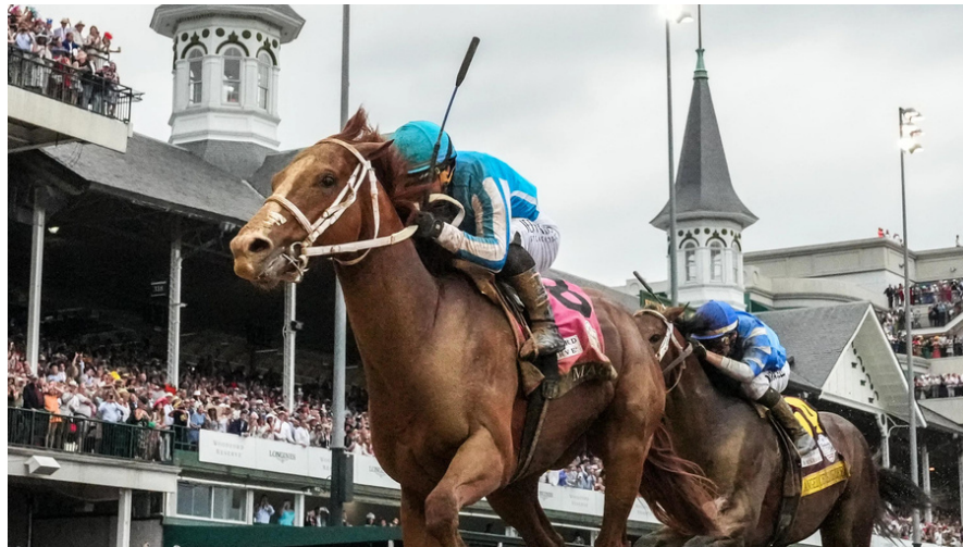
Pictured: Mage - winner of the 2023 Kentucky Derby