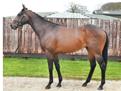
Pictured: Lope de Vega x Regalline colt