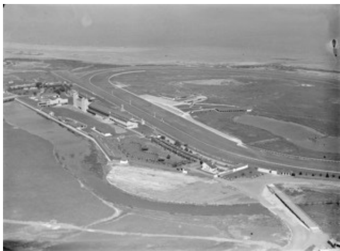
Pictured: Williamstown Racecourse

Most picturesque of the tracks was the Williamstown racecourse. This course had smart grandstands and facilities, and would have been a very attractive venue for the Sport of Kings. Serious races were held at Williamstown, and the track was even graced by the great Phar Lap who won the Underwood Stakes there in 1931. The last meeting was in 1940; like many courses it was taken over by the military during WW2, and tragically the grandstands burned down in 1947.