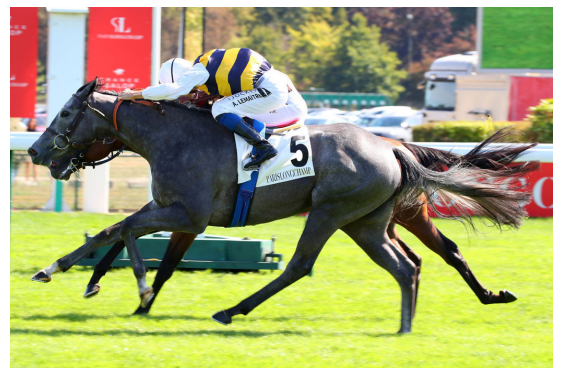
Pictured: Tigrais winning G3 Prix La Rochette

While June and July are key months, the European season is strong until October with feature Group 1 racing. The ultimate of course being The Arc in early October. It's a dream for connections worldwide to be a contender in that great race.