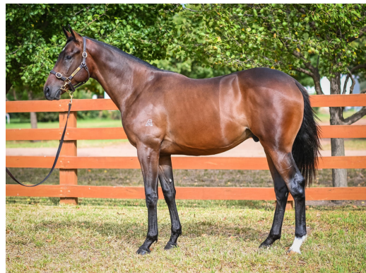
Pictured: So You Think x Sweet Martini colt