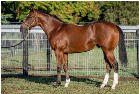
Pictured: The Autumn Sun x Acouplamas colt