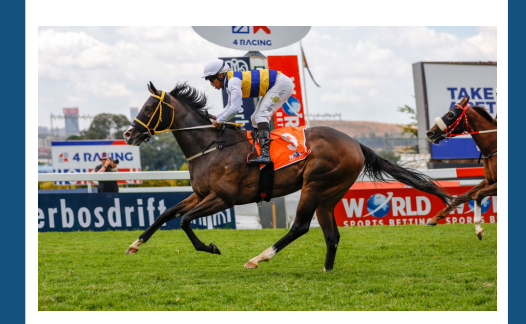
UNDER YOUR SPELL 1400m G2 Hawaii Stakes, Turffontein Trained by S. Tarry