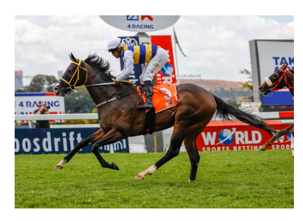
Pictured: Under Your Spell winning the G2 Hawaii Stakes

A very special moment last weekend with Under Your Spell winning the Group 2 Hawaii Stakes at Turffontein, South Africa, which makes it the 8th country we've experienced stakes-winning success in.