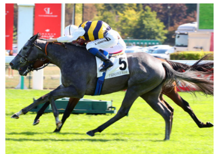
Pictured: Tigrais wins the G3 Prix La Rochette, Longchamp (FR)