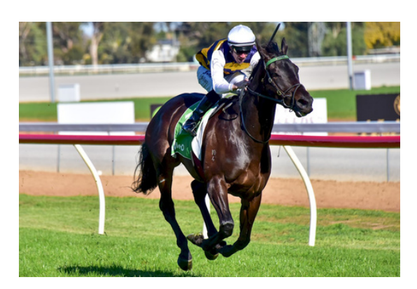
Harbour Views wins at Swan Hill

NAME THE RACECOURSE : Coleraine The Coleraine Cup will be held on the 23 September, 2022