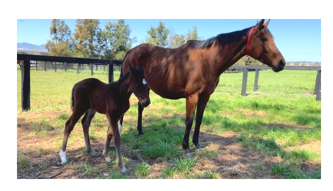
Natural Blues alongside her foal

The filly currently resides at Yarraman Park Stud, based in the Hunter Valley region of New South Wales. You can click HERE to watch a video of the foal alongside her dam.