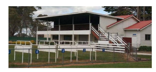
NAME THE RACECOURSE Hint: 23 September