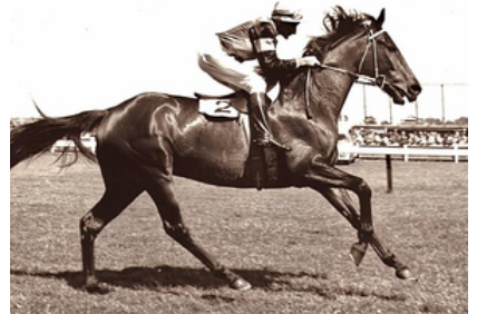
Rising Fast, 2-time Caulfield Cup champion

Hezashocka, San Huberto, and Dagiansweet Junior.