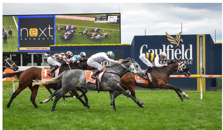
ABOVE: BLUE OCEAN wins at Caulfield

During his time there, he will assist in providing support to Racing Heart's therapy patients. OTI is delighted to see that he has not only found a wonderful new home, but will be providing aid to the wider community in his retirement.