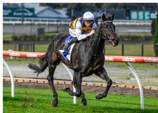
Harbour Views wins at The Valley, 13 June 2020

OTI and connections wish Harbour Views all the best for his retirement from racing.