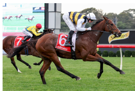
Eaglemont wins at Sandown, 11/05/22

Widgee Turf is sired by stallion Turffontein.