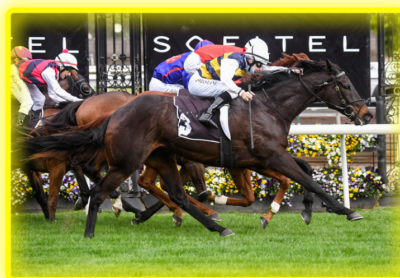
HARBOUR VIEWS wins the Listed The Sofitel, 11 September 2021.