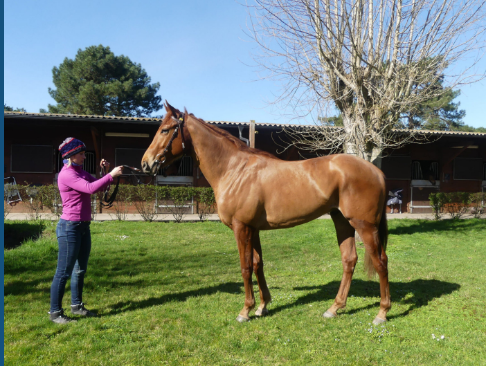
Strong, athletic 2yo colt by the sire of the Arc winner Sottsass

Standing at 16 hands, this colt continues to strengthen and mature into his impressive frame.