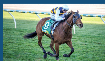
TIGRE ROYALE Geelong